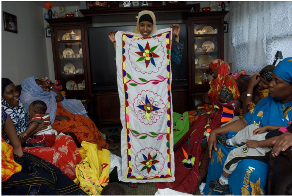
Ugutaka kw'aba Somali-Bantu