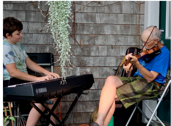
Intambo n'umuziki wa New England