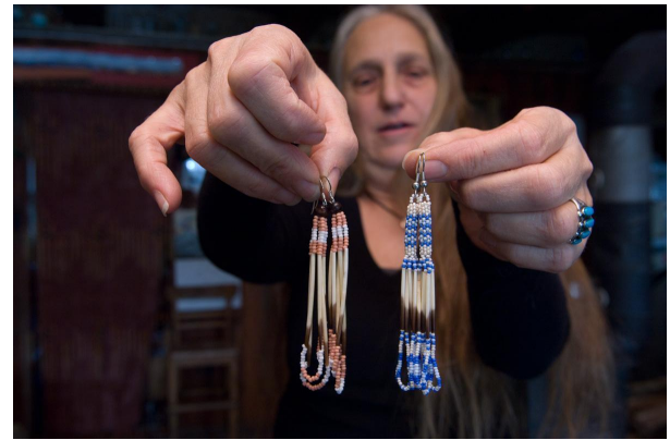
Ubudede bw'aba Abenaki