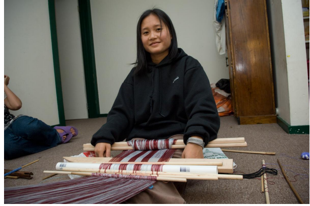
Ugushona kw'aba Burma